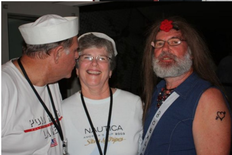
Past and Present Wizzy winners