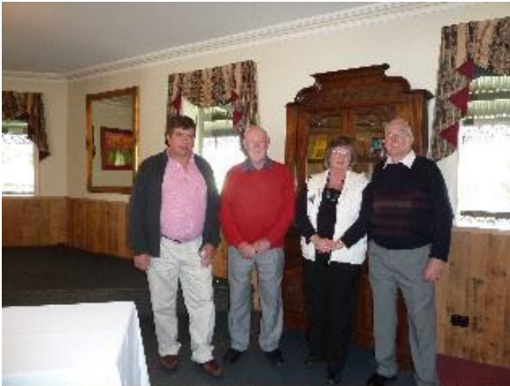
Photo of the four Presidents at the recent lunch in Woodend